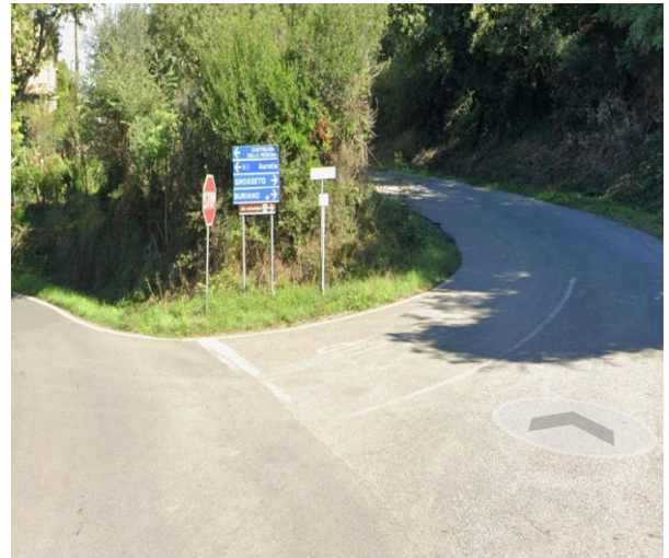
30 junction for Via dei Sepolcri – archaeological area

Project carried out with the contribution of the