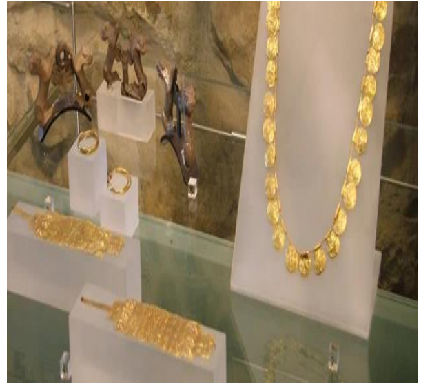
10 jewels on display at the Museum