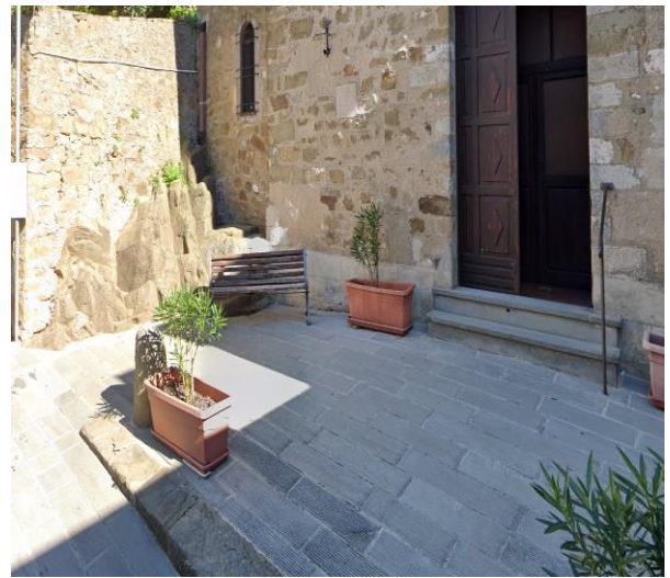
16 entrance to the church of S. Simone e Giuda

Project carried out with the contribution of the