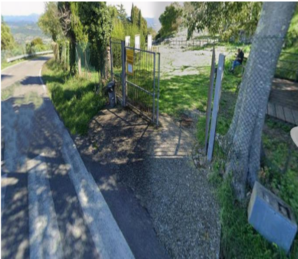
29 entrance Excavations in the city

It is advisable to visit the Via dei Sepolcri by car.