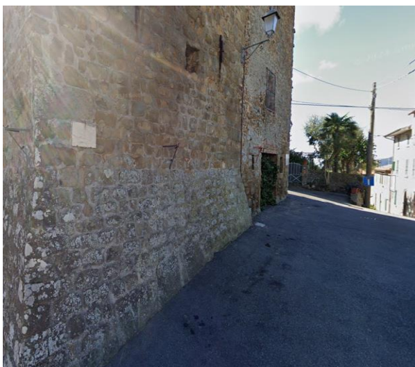
27 Medieval fortification