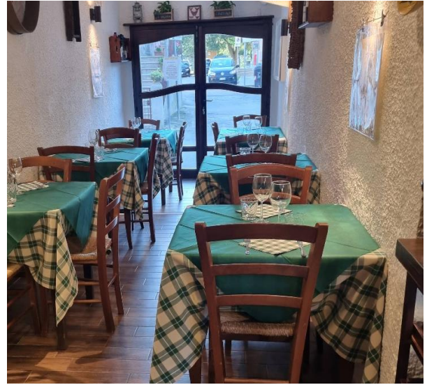
36 indoor restaurant tables

Project carried out with the contribution of the