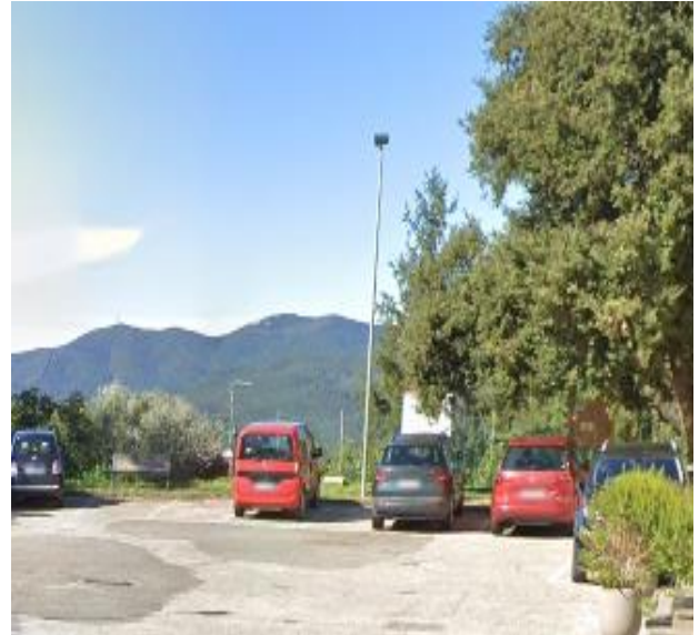
2 Vatluna Square Public Parking