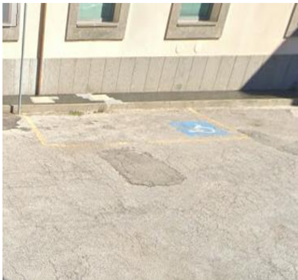
3 Reserved parking Vatluna Square