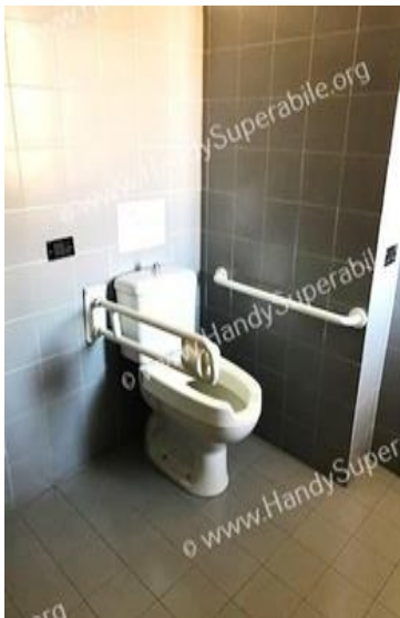
38 toilets and grab bars