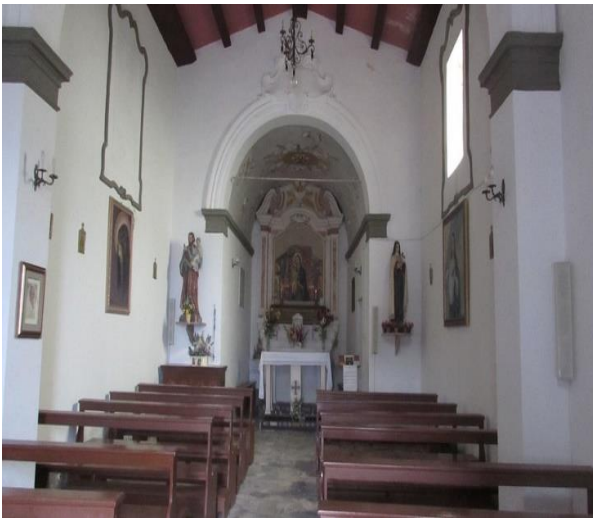
25 central altar and interiors of the Oratory of Santa Maria of graces