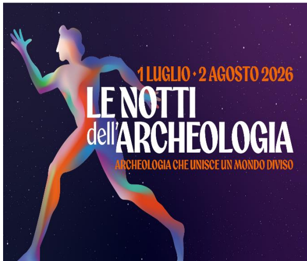
33 Poster the nights of archaeology