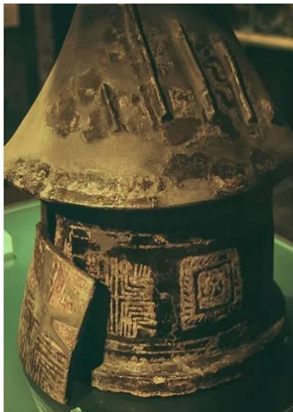
11 Etruscan find