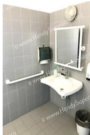
39 washbasin and reclining mirror

Project carried out with the contribution of the