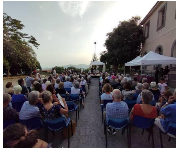
34 Archaeology Nights Outdoor Conference