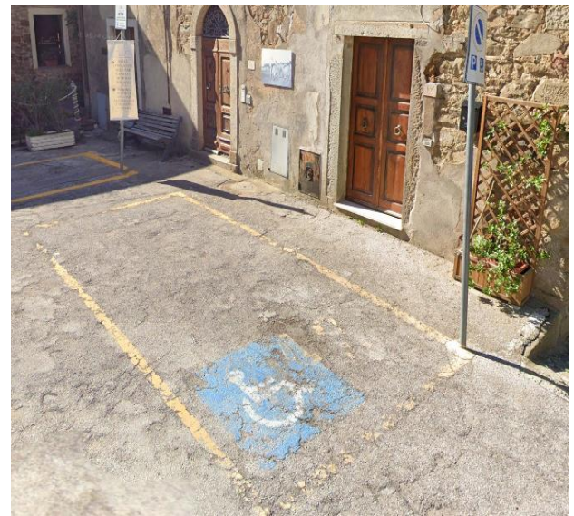
4 Piazza Stefani Public Parking

Project carried out with the contribution of the