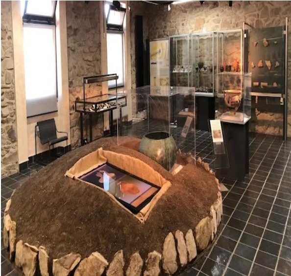
9 objects exhibited at the Museum