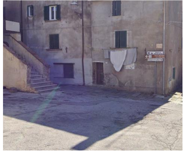
14 Beginning of the route for Cyclopean walls