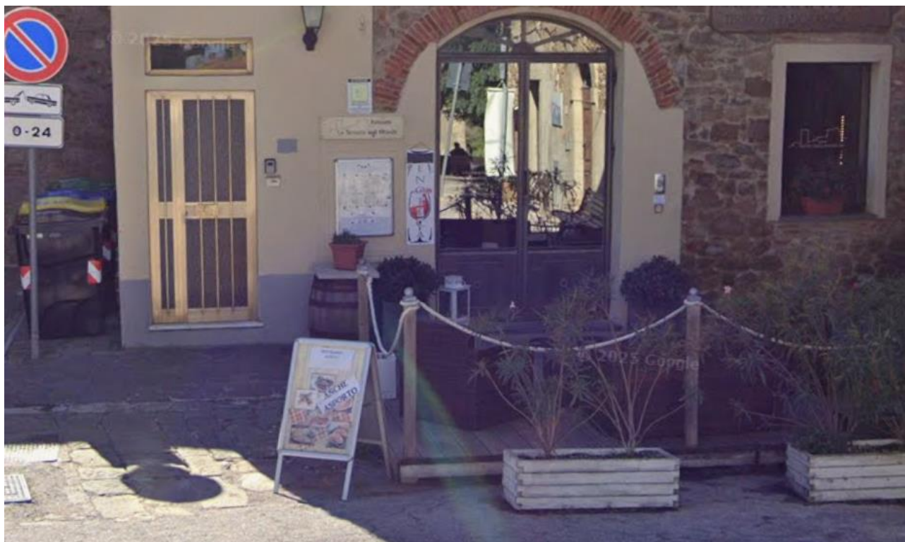
37 Entrance to the restaurant La Terrazza degli Etruschi