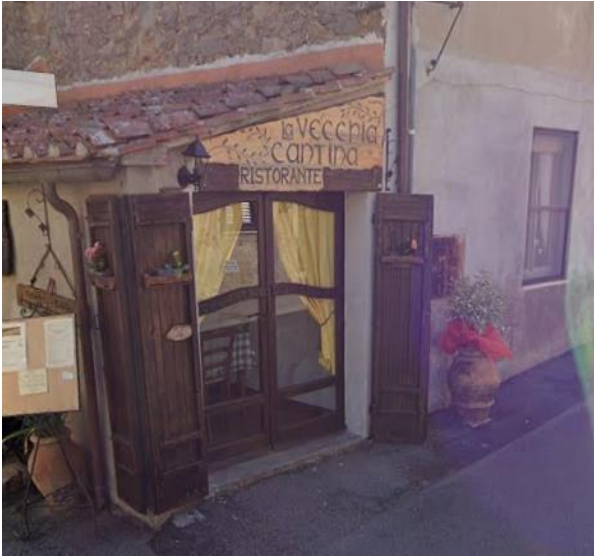
35 entrance The old cellar