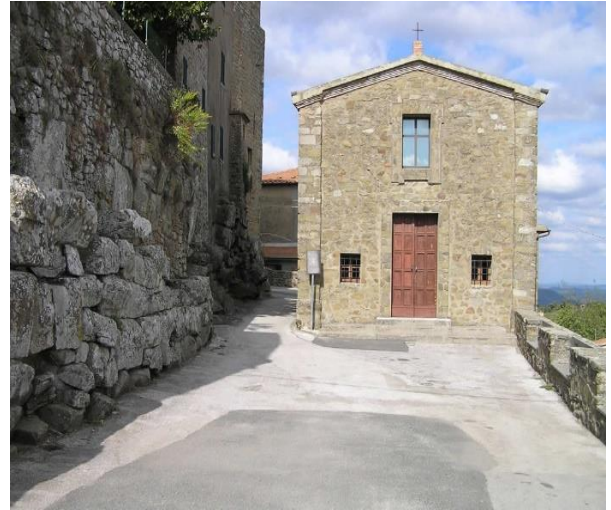
24 Façade of the Santa Maria delle Grazie oratory