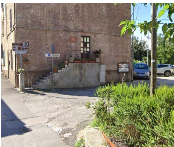
7 Parking entrance Vatluna Square

The 7 rooms on 2 floors can be reached by lift, with a useful width of the car door of 86 cm, internal dimensions of the car: width of 137 cm x depth 150 cm and push-button panel with the highest button placed 95 cm from the ground.