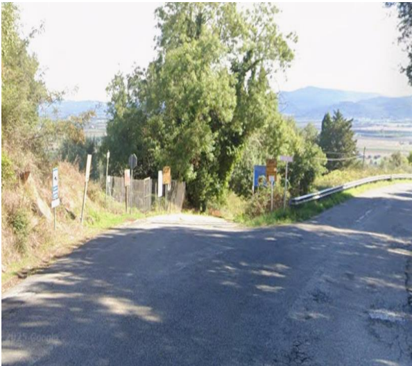
31 entrance via dei Sepolcri